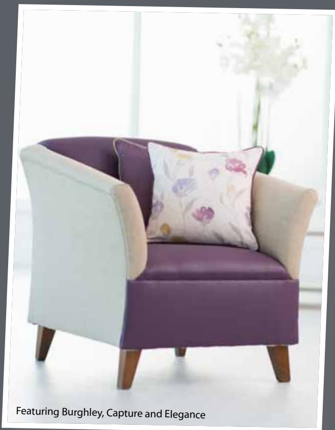
Featuring Burghley, Capture and Elegance