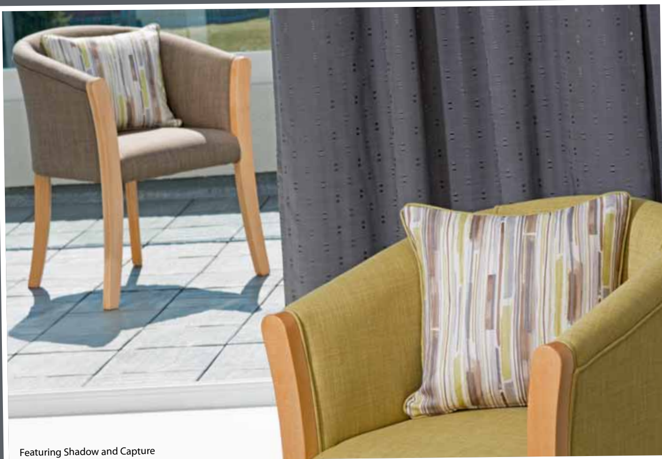
Featuring Shadow and Capture

Whilst we endeavour to ensure that every batch matches our swatches, variations do occur. If you require an exact match to a previous order please make the sales team aware at the time of ordering and if necessary please send a cutting for us to match to.