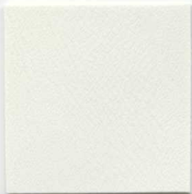
CTP 4001 SNOW