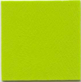
CTP 4004 AVOCADO