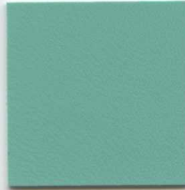
CTP 4006 AQUA