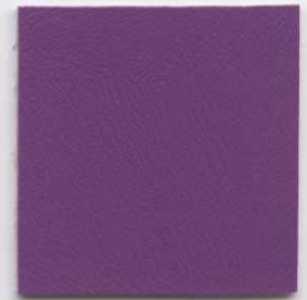
CTP 4009 DAMSON