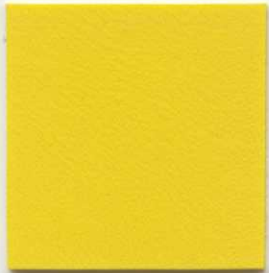
CTP 4003 SUNFLOWER