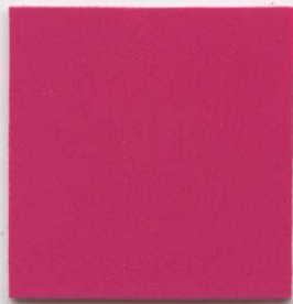
CTP 4016 DEEP PINK