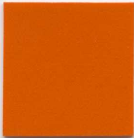
CTP 4019 TANGERINE