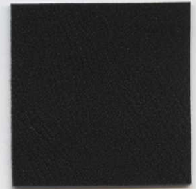
CTP 4014 CHARCOAL

ANTIMICROBIAL ★ PHTHALATE-FREE ★ FLAME RETARDANT