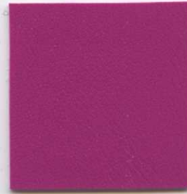
CTP 4017 FUCHSIA