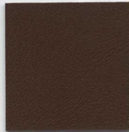
CTP 4013 MOCHA