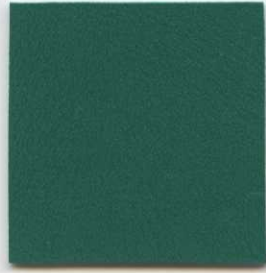
CTP 4007 FOREST