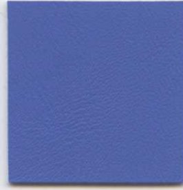
CTP 4008 LAVENDER