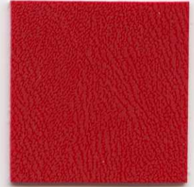
CTP 4020 CRIMSON