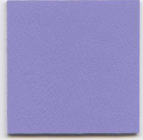
CTP 4005 HYACINTH