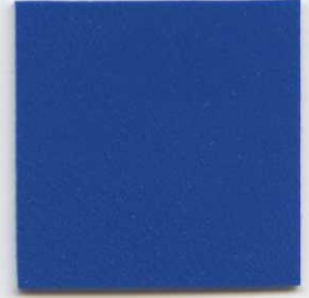
CTP 4012 PACIFIC