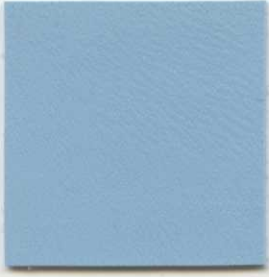
CTP 4010 ARCTIC BLUE