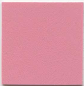
CTP 4015 CANDY FLOSS