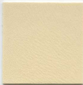
CTP 4002 CREAM