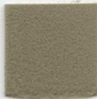
PLAIN STRETCH 205 Sage