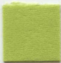
PLAIN STRETCH 226 Lime