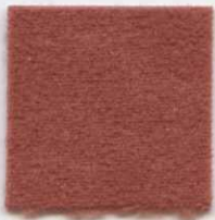
PLAIN STRETCH 618 Blush