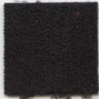
PLAIN STRETCH 949 Noir