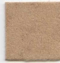
PLAIN STRETCH 804 Fawn