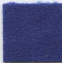
PLAIN STRETCH 117 Royal