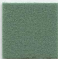
PLAIN STRETCH 201 Jade