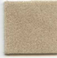
PLAIN STRETCH 815 Buff