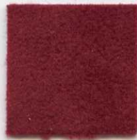
PLAIN STRETCH 405 Crimson