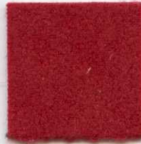
PLAIN STRETCH 400 Red