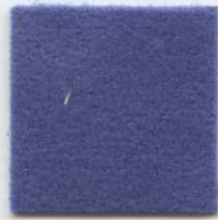
PLAIN STRETCH 107 Cornflower