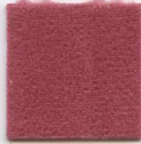
PLAIN STRETCH 600 Pink