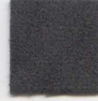
PLAIN STRETCH 902 Slate