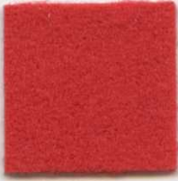
PLAIN STRETCH 429 Chili