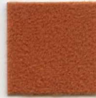
PLAIN STRETCH 402 Orange