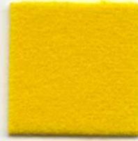
PLAIN STRETCH 313 Yellow