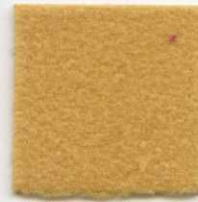
PLAIN STRETCH 312 Old Gold