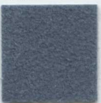
PLAIN STRETCH 129 Ocean