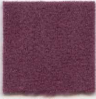
PLAIN STRETCH 509 Plum