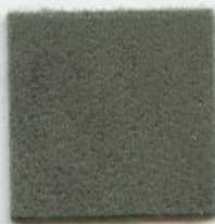
PLAIN STRETCH 211 Spruce