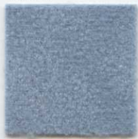
PLAIN STRETCH 139 Aqua