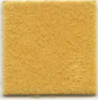
PLAIN STRETCH 301 Saffron