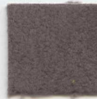
PLAIN STRETCH 906 Ash