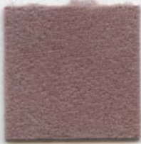
PLAIN STRETCH 703 Mink