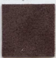
PLAIN STRETCH 702 Chocolate