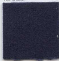
PLAIN STRETCH 105 Indigo