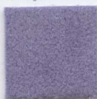
PLAIN STRETCH 127 Lilac